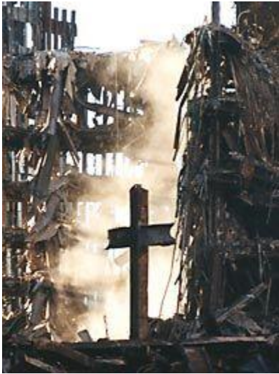
Remembering the tragedy of September 11, 2001

TODAY'S READINGS: Colossians 1:24—2:3; Luke 6:6-11 (437) . "Let us celebrate the festival, not with the old yeast, the yeast of malice and evil, but with the unleavened bread of sincerity and truth."